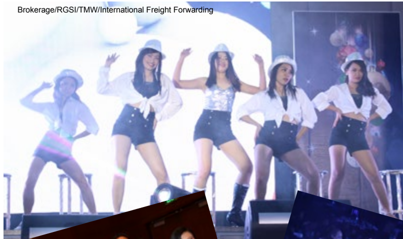
Brokerage/RGSI/TMW/International Freight Forwarding

The hall turned fiery red with the Contract Logistics and LIMA Logistics' energetic performance and breathtaking lifting and exhibition. Fifth on the line is the Blue team (Support group) who did a mash up of a tribal concept and Frozen-theme presentation. Last, but not the least, the Silver group (International Freight, Customs Clearance & Brokerage (CCB), and TMW Worldwide Express) dazzled with their own version of the 2015 hits from Korea, Philippines, and USA.