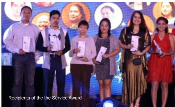
Recipients of the the Service Award