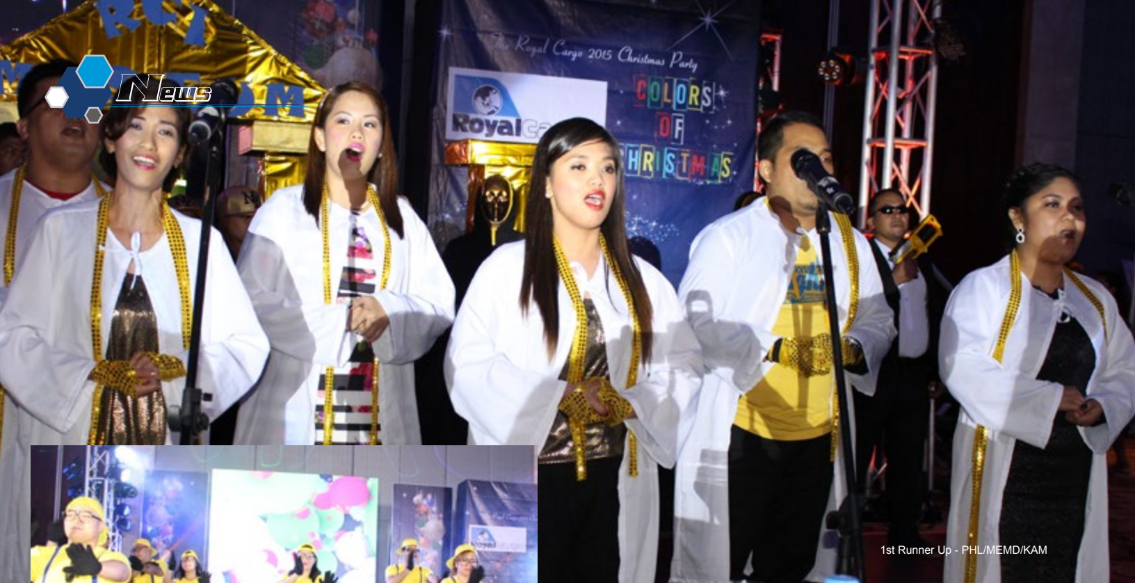
1st Runner Up - PHL/MEMD/KAM