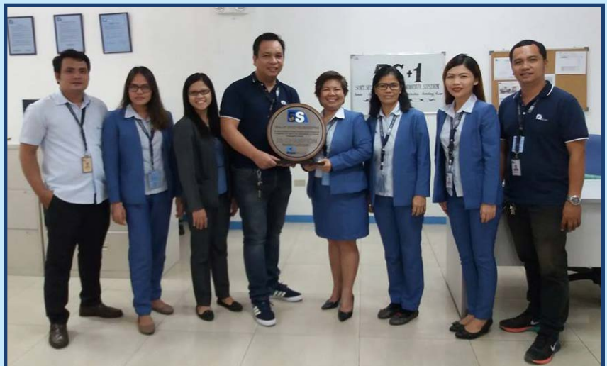
Freight Cavite Team with the QMS Team