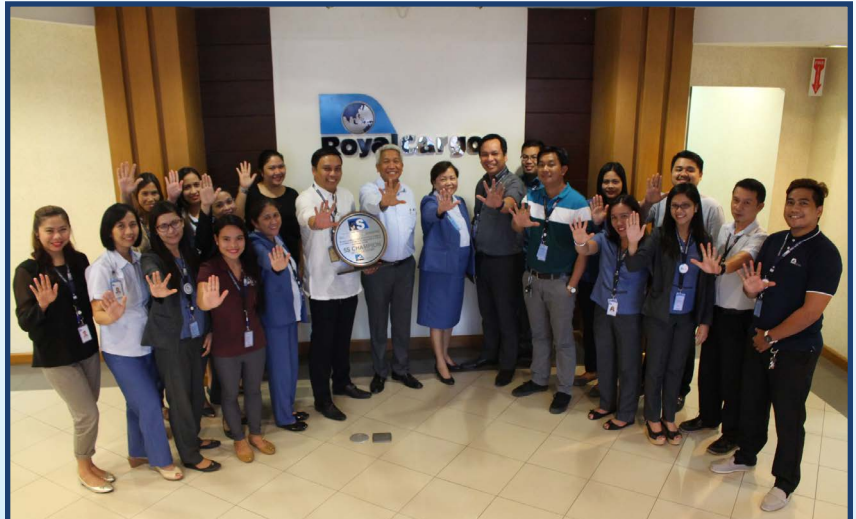
Functional Services Team with the 5S Chairman