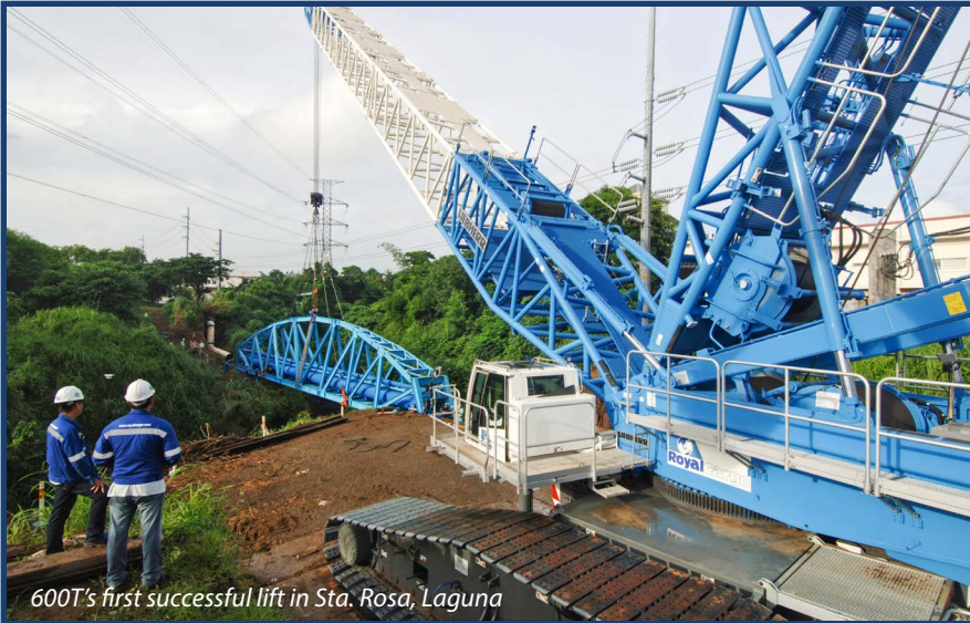
600T's first successful lift in Sta. Rosa, Laguna

Royal Cargo's new Liebherr LTM 1500 – 8.1 mobile crane and Liebherr LR 1600/2 crawler crane arrived last April 10 and April 13 respectively at Bauan International Port, Inc. (BIPI), Batangas.