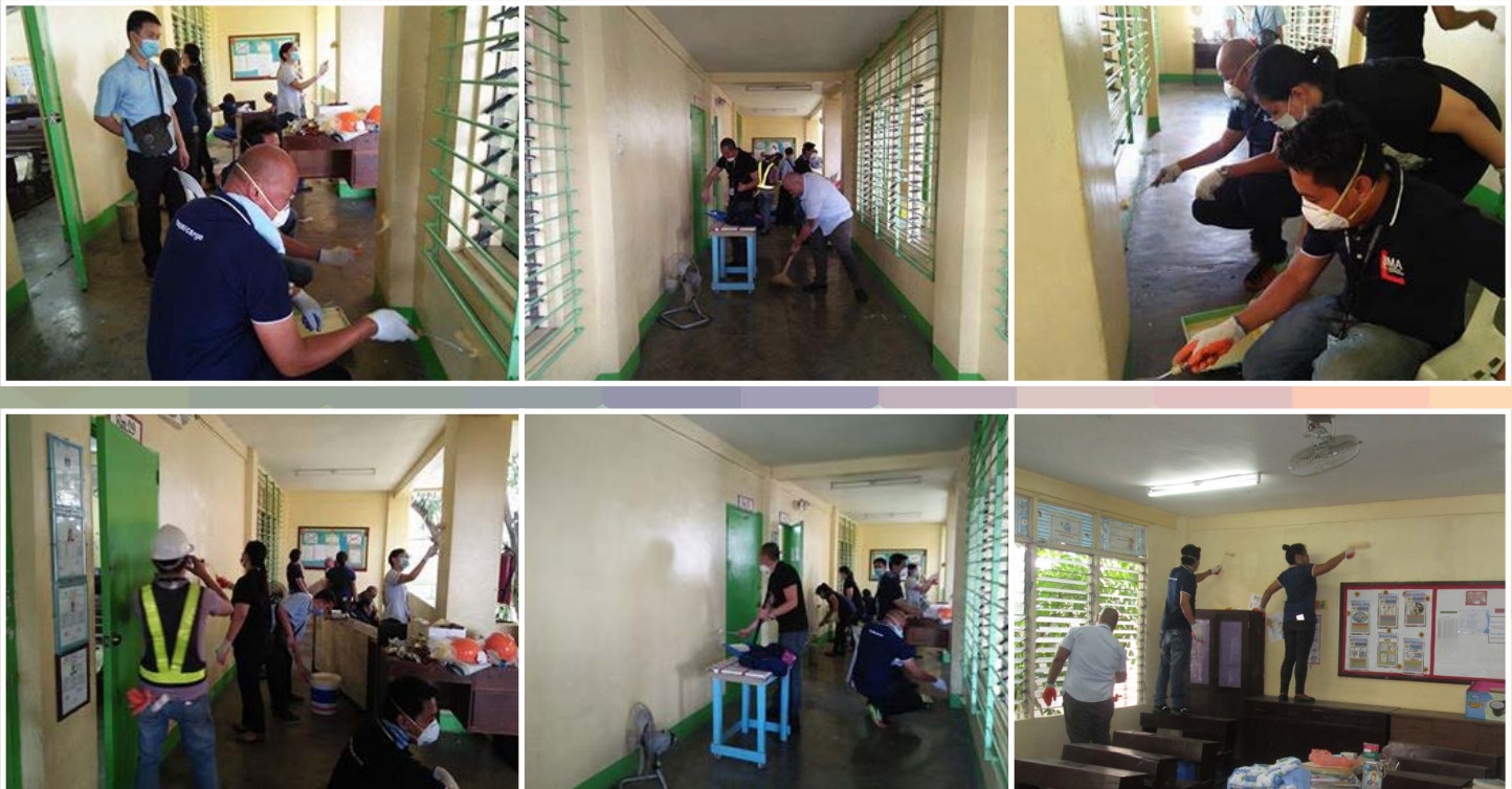
In Photos: Royal Cargo volunteers who joined the Brigada Eskwela 2017 in Sto. Niño Elementary School repairing, painting and cleaning the school surroundings to ensure that the school facilities are prepared for the upcoming school opening