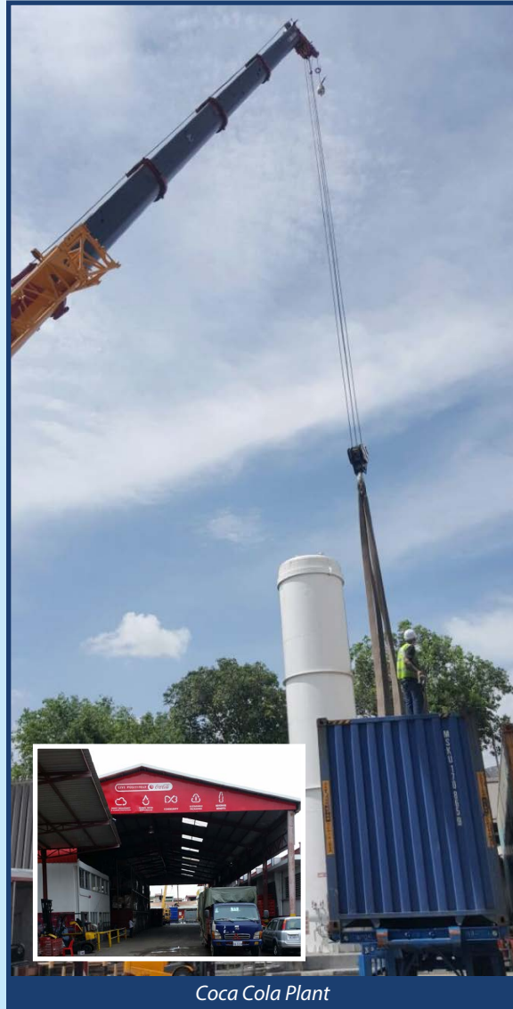
Coca Cola Plant

Providing solutions under time pressure convinced the client to award additional shipments to Royal Cargo as they had additional cargo to be relocated from Coca Cola Singapore to Myanmar.