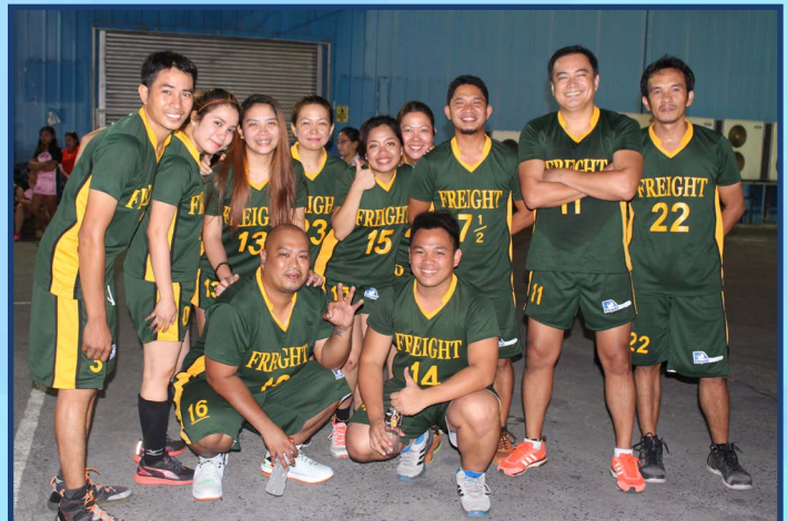
The FREIGHT Team (3rd Place)