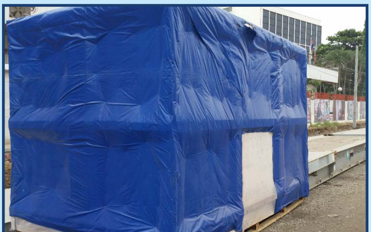
Temporary roadside storage due to roadworks