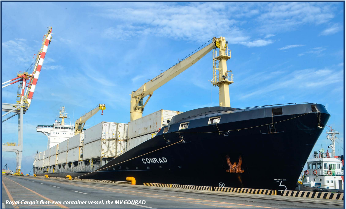
Royal Cargo's first-ever container vessel, the MV-CONRAD

Royal Cargo officially forays into the shipping business with the arrival of its first-ever container vessel that berthed at Batangas Port last June 13, 2017.