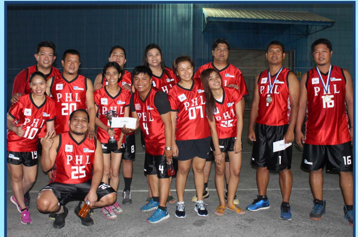
The PROJECTS Team (2nd Place)

All winners received cash prizes and tokens – trophy for each team, best muse and MVP and medals for the Mythical 6.