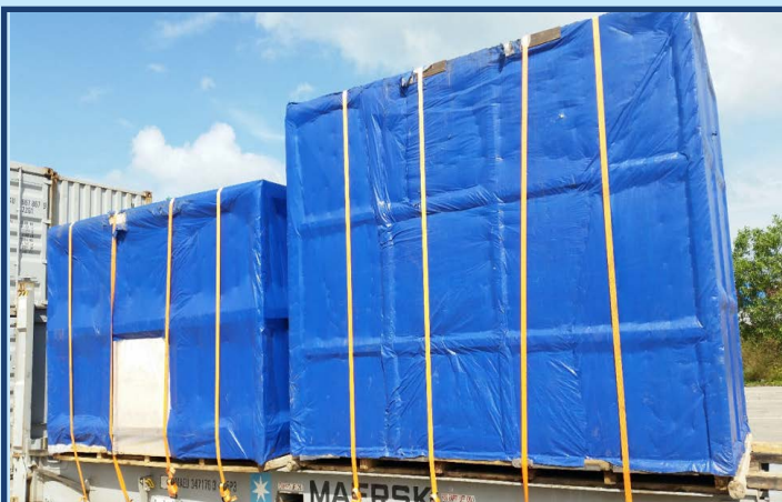
Flat rack cargo after lashing at the port