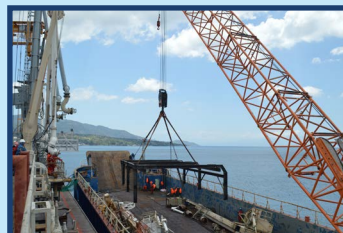
Lifting of loading arms weighing 38 tons