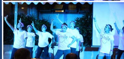
In Photos from Top to Bottom: Winners of Group Presentation - PHL/KAM/ITA/OP (1st), CCB (2nd) and LLC (3rd)