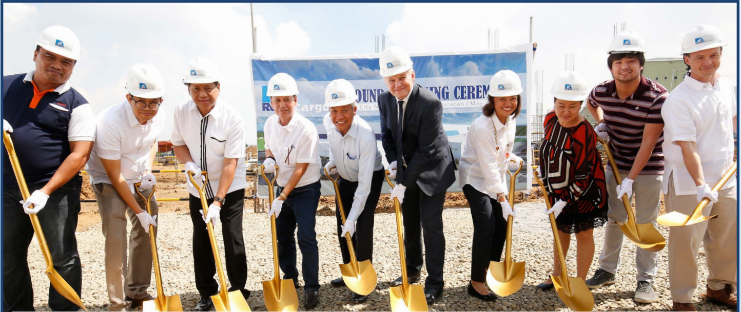
Royal Cargo executives and invited guests attended the Royal Cargo City North Hub Groundbreaking Ceremony in Plaridel, Bulacan.