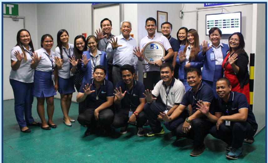
Premium Courier Team with the 5S Chairman and Vice Chairman