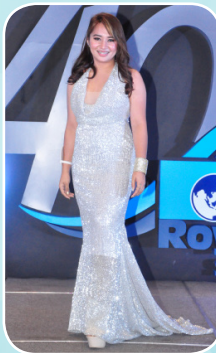
Edeelyn Amigos 2nd Place